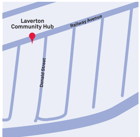
Laverton Community Hub 95-105 Railway Avenue, Laverton 3028

Registration Night Hobsons Bay Civic Centre Wednesday 7 March, 7.00pm onwards 115 Civic Parade Altona 3018